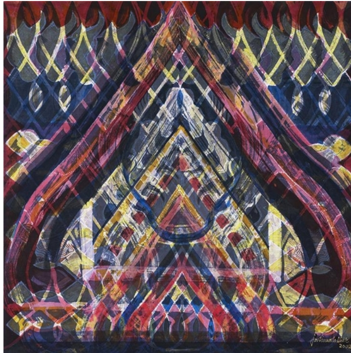
Figure 4: Fatimah Chik, Batik laid on canvas: Pohon Beringin , 122 cm × 122 cm, (2002)

cultural aspects of the Malay tradition that has been inherited since the ancient times.