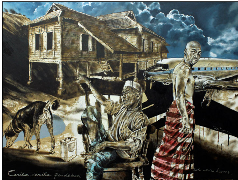
Figure 3: Jalaini Abu Hassan's Tales of the Heroes (2010), Acrylic and bitumen on canvas, 137 cm × 183 cm.